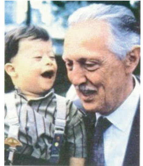
Dr. Lejeune with one of his beloved Down acquaintances.

Jérôme Lejeune received numerous awards and was elected as a member of several academies. In 1962 he was honored in Washington, D.C. by President John F. Kennedy with the first Kennedy Prize for his research into genetic intellectual disability and for finding the genetic cause of Down syndrome. In 1969 he received the William Allen Award from the American Society of Human Genetics – the highest award possible for a geneti-