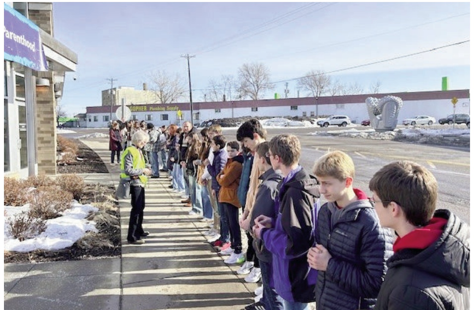
Students from Holy Family Church and School prayed outside Planned Parenthood during this past Lenten 40 Days for Life in St. Paul.

I'm praying for every day to be filled. Yes, all 40 of them. When Regions Hospital closed its abortuary, our 40 Days for Life there was a 24/7 for 40 days campaign. Thirty-five of the ADOPT-A-DAYS were filled and God moved mightily.