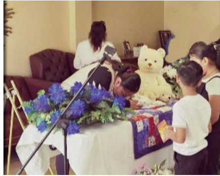
Mom weeping over her beloved child.

This was the first time I've ever gone to the funeral of a little one saved from abortion in all the years I've been minis-