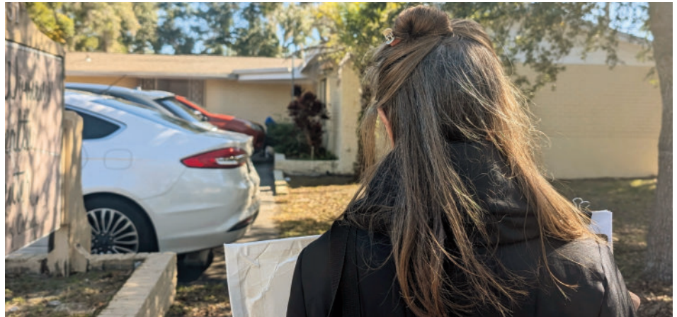
A sidewalk counselor reaches out to abortion clients with life-affirming help outside the All Women's Health Center (AWHC) in Central Florida.