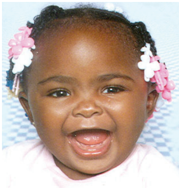
This beautiful little girl is one of the hundreds of babies saved from the Robbinsdale Clinic over the years.

2024, yet it was far better known in the Minneapolis/St. Paul area as an abortion facility.