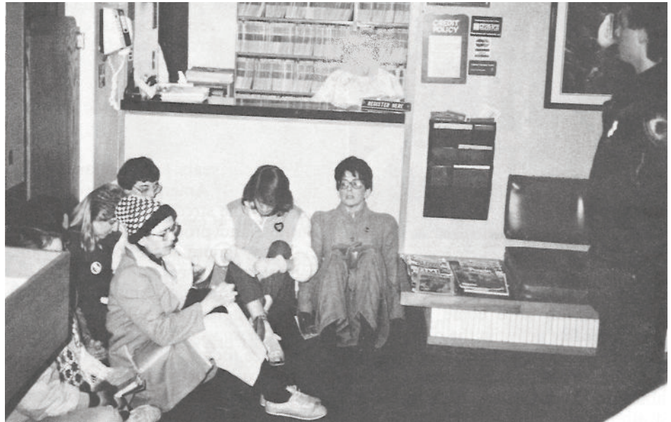
This 1986 sit-in conducted by Pro-Life Action Ministries inside the Robbinsdale abortion facility waiting room and hallway was one of several “rescue missions” conducted there in efforts to peacefully halt the killing.