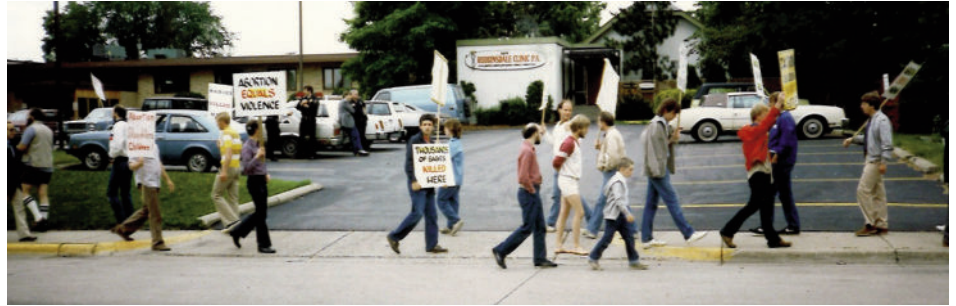
One of the first events conducted by Pro-Life Action Ministries outside the Robbinsdale abortion facility was this Father’s Day Rally in 1985.