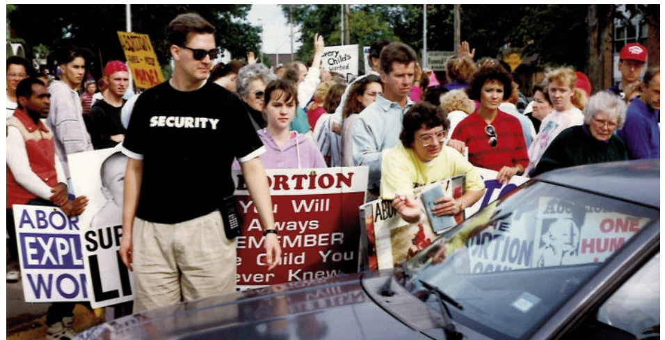
Scores of both pro-life and pro-abortion supporters were present on the sidewalks near the Robbinsdale abortion facility on Saturdays in 1992, even as sidewalk counselors continued to reach out to the abortion clients. Then a court order eventually limited the number of people from either side near the driveway and in the immediate area.