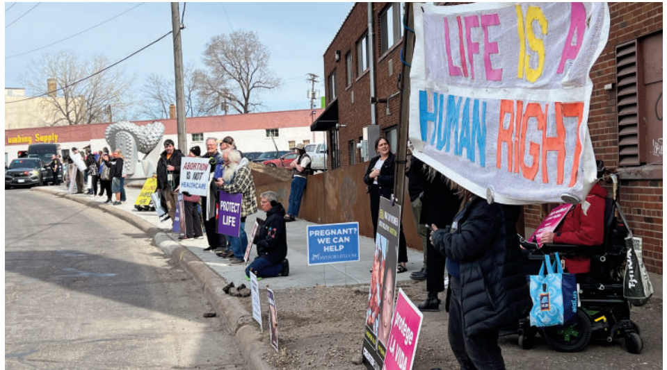
Pro-lifers protest across the street from the St. Paul Planned Parenthood during the March 14 press conference with Vice President Kamala Harris. A few protestors with other causes showed up as well.

Harris said she was there "to uplift the work that is happening in Minnesota as an example of what true leadership looks