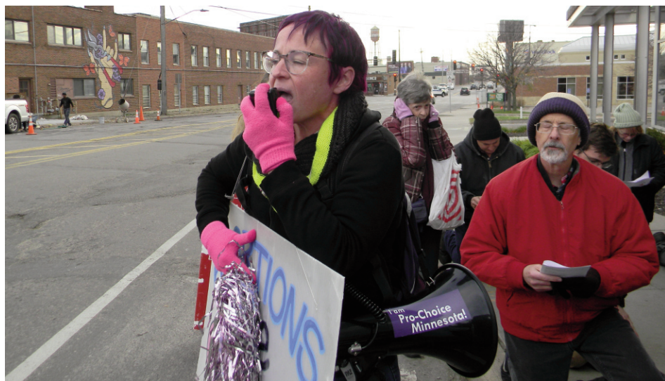
Regular pro-abortion agitator aims her very loud bullhorn at kneeling prayer supporters while one pro-lifer tries to protect her ears during our 40 Days for Life closing vigil November 5.