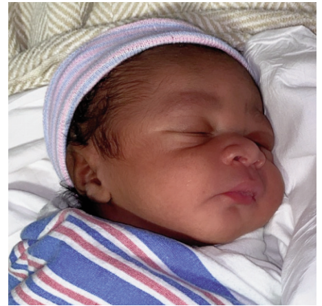
This little boy was saved from the AWHC abortion mill in Central Florida this past summer and was born in December! Our sidewalk counselors hosted a baby shower for his mother before his birth (photo below).

We give God all the glory for intervening on behalf of this child, and are ever so mindful of yet another little miracle baby saved from the brutal act of abortion. These little lives matter to the Lord, and because faithful servants gave of their time to stand on the sidewalk in front of the AWHC abortuary that almost fateful day, a child was saved, a child was born, and a mama knew people cared. For that we cry "Hallelujah," and pray that God will use this child in a great and mighty way.