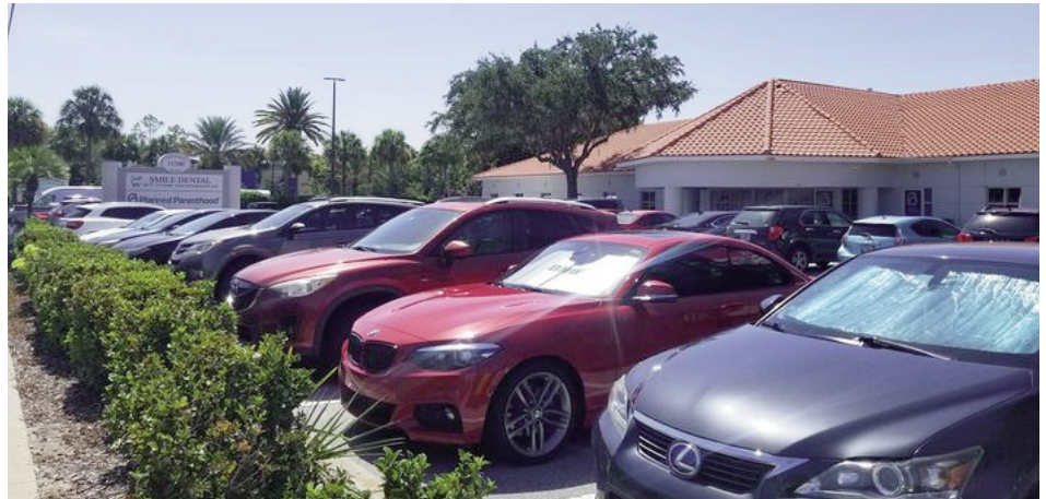
A packed parking lot outside the Planned Parenthood abortion mill in Orlando in late July

Some states immediately either banned abortions, or put restrictions on this brutal act, other states expanded the so-called “right” to kill the unborn.