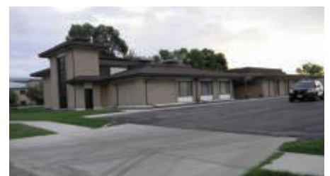
Red River Women's Clinic's new killing center in Moorhead, Minn.

"The weapons we fight with are not the weapons of the world. On the contrary, they have divine power to demolish strongholds. We demolish arguments and every pretension that sets itself up against the knowledge of God, and we take captive every thought to make it obedient to Christ." - 2 Cor. 10:4-5