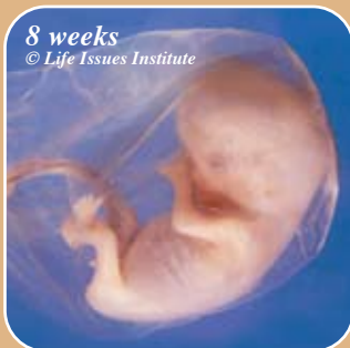
8 weeks

He or she needs your care right now. Don't let the abortionist harm your baby.