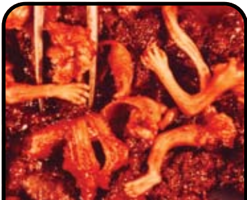
Suction abortion at 10 weeks